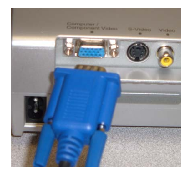
Step 1. Connect laptop and projection unit with a monitor cable: